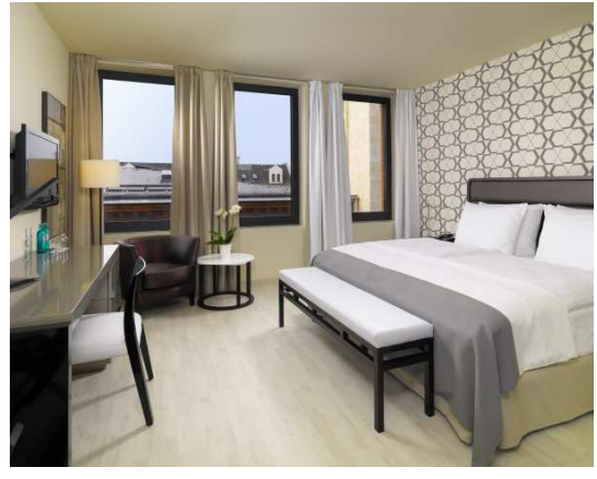
Deluxe Double Room

Our restaurant "Salt & Pepper" with a mix of delicate Mediterranean and international food, our bar at the lobby, our business centre and an underground garage complete our offer. Our charming typical Berlin terrace is perfectly suited for smaller events.